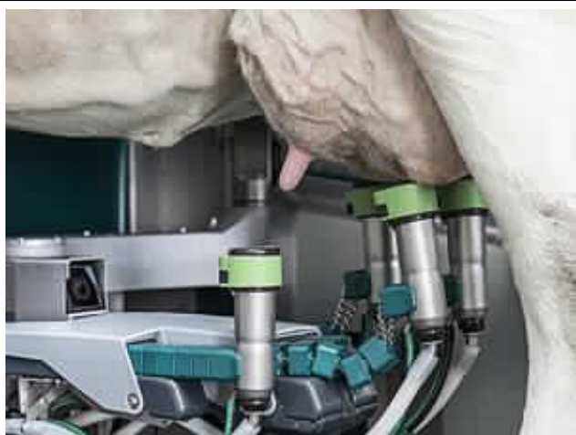
GEA's modular milking robot can be installed in any parlor.

One of the big winners this year is GEA with a modular robotic milking unit that,